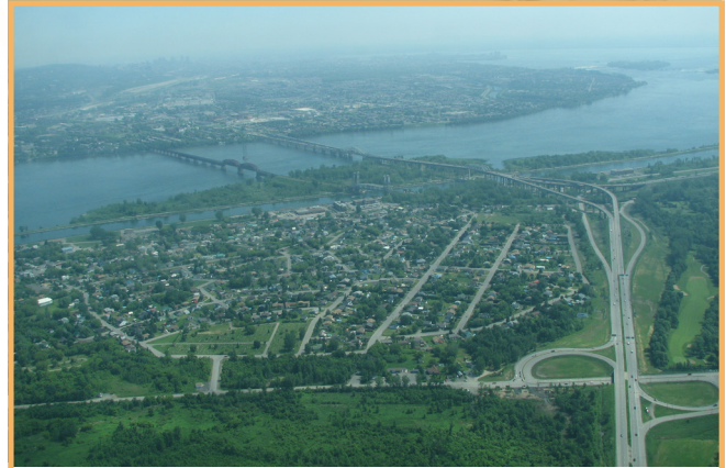
Aerial view of Kahnawake, Quebec

How one Mohawk community is embracing the power of data in a unique and inspiring new way